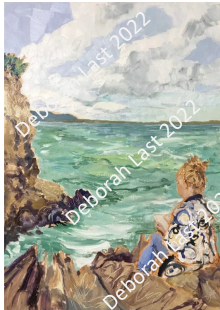
Original Artwork (42 x 59.4 cm) Deborah Last 2022